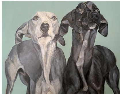
Camilla Frederick Shades of Grey