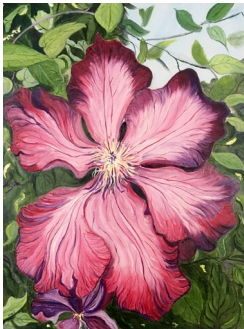
Hilary Jackson Clematis in Bloom