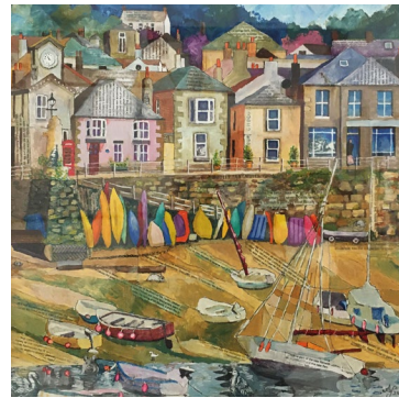
Amy Yates Mousehole