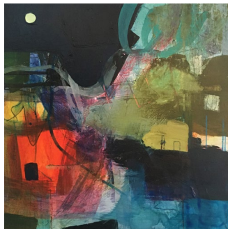
Sarah Ball Cape Cornwall